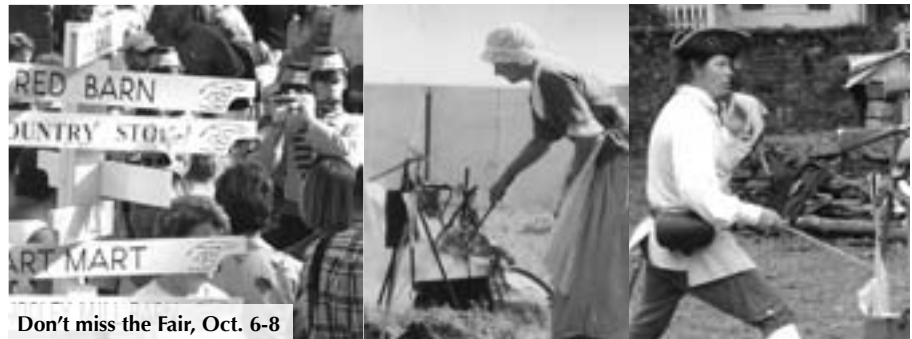
Don't miss the Fair, Oct. 6-8

AT&T, Bank of America, Boeing, Cingular Wireless, GMAC, Dominion, Sprint, PepsiCo, ExxonMobil, Verizon, IBM, and Home Depot are only a few!