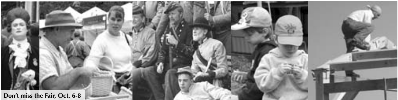
Don't miss the Fair, Oct. 6-8